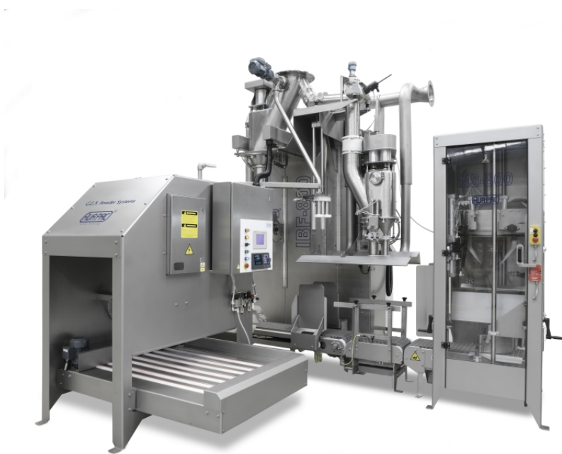
AVALON Automatic Bag Presenter and Inline IBF-800 25kg bagging-off machine installed at the COLUN factory.

To reduce manpower during bagging off, an automatic bag presenter is used. From the bag filler the bags are automatically conveyed via a neck stretcher onto the heat sealer, metal detector and check weigher before the bags are coded and placed on pallets.