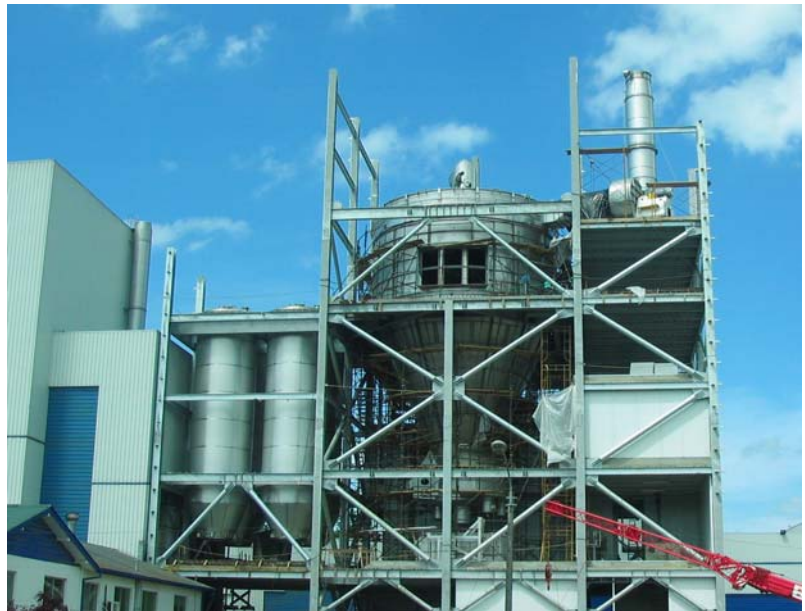
Powder Silos and IFD™ Dryer under construction

The project was defined for Niro to be from inlet of the product to the evaporator until the powder was in 25 kg bags on a pallet.