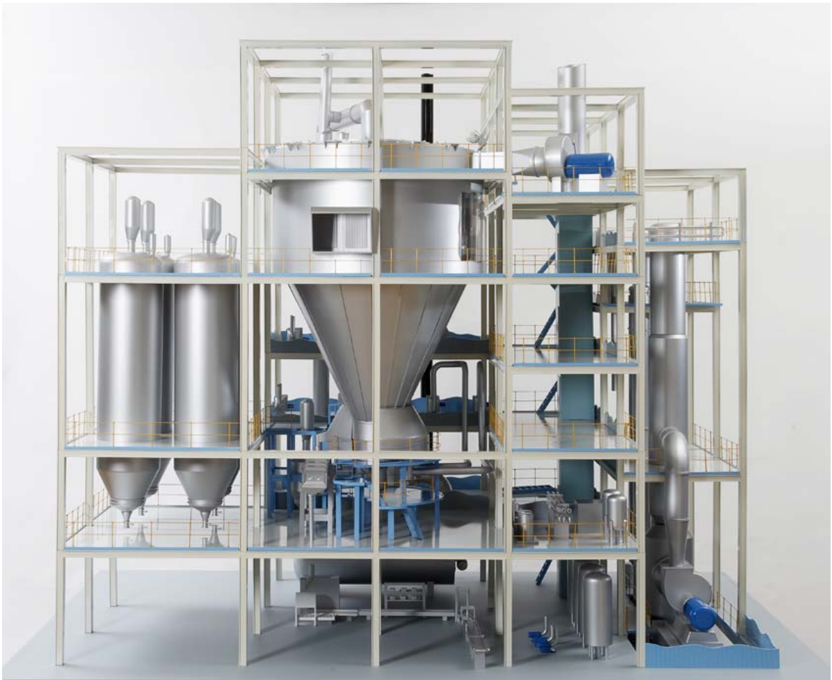
Model scale 1::25 of the new powder plant installed at COLUN in Chile

and together with Niro, Colun has lived up to their visions.