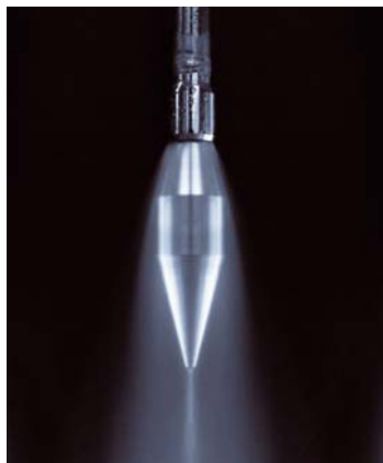
Reverse Jet Air Nozzle

is removed by a compressed air stream blown into the inside of each bag by means of a specially designed reverse jet air nozzle (patented) positioned above each bag.