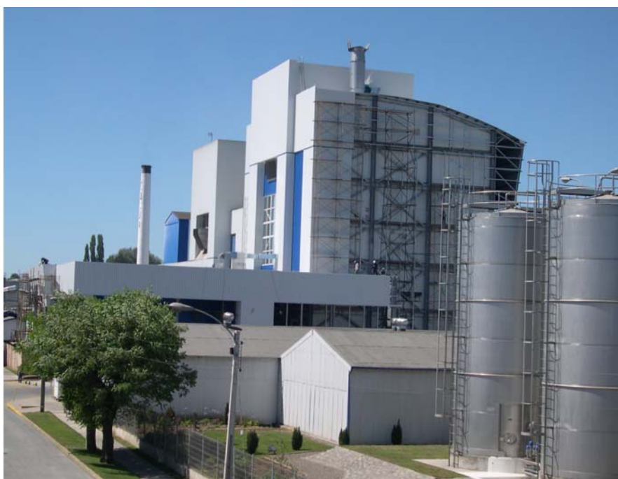
COLUN factory with the new Integrated Filter Dryer, IFD™

New professionals have been hired in recent years in different areas such as sales, marketing, strategic planning, production, product development and engineering to assure the continuity and the future development of the cooperative.